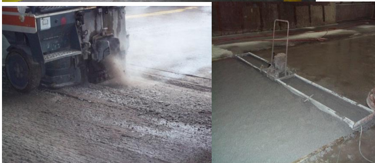
Application of Densitop to Concrete flooring at Dargan Road